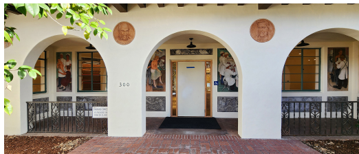
Palo Alto Museum, newly renovated entrance