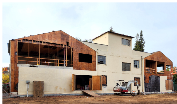
Rear view of Palo Alto Museum, construction and rehabilitation phase