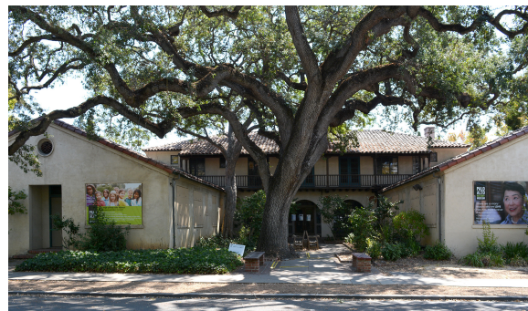
Palo Alto Museum, front patio

The PAST Heritage Historic Preservation Award recognizes projects that rehabilitate or restore local historic buildings. This year's honoree is the new Palo Alto Museum soon to open at 300 Homer Avenue. The museum is being recognized for extensive renovation and modernization of the historic Roth building designed by Birge Clark that originally housed the Palo Alto Medical Clinic.