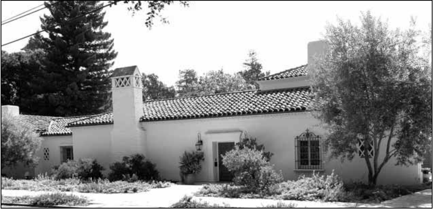
1184 Palo Alto Avenue