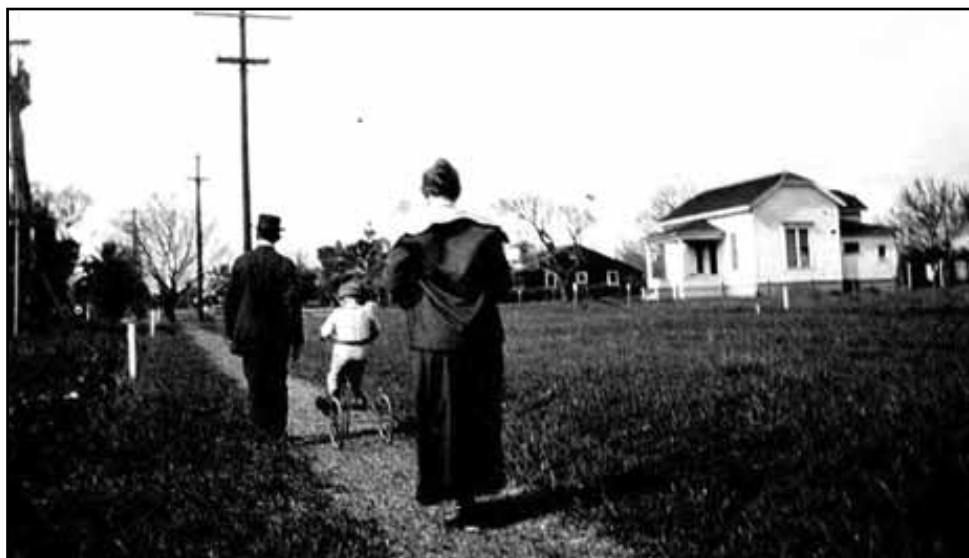
Ashby house, built 1889

Boyce subdivided seven 100-foot wide lots along Pitman. Boyce held onto a 300-plus-foot wide parcel adjoining Ashby (Lincoln) where with two houses addressed at 951 and 955 (Channing) were built, including a huge water tank behind 951, which remains from the 1880s.