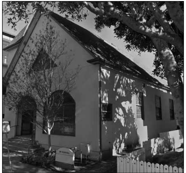
AME Zion Church, 819 Ramona St, Homer Ave Tour