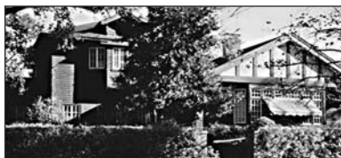
Built in 1915: 340 Coleridge, Palo Alto (left) and 755 Santa Ynez, Stanford (right).