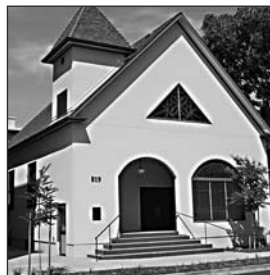
819 Ramona, built for the AME Zion Church before and after restoration. Awarded a PAST Preservation Award in 2011.

While new property owners may be attracted to the idea of tearing down existing buildings to use their land in new ways, historic preservation offers the possibility to utilize existing structures for new purposes. Classic homes can be refurbished to hold modern amenities, such as updated plumb-