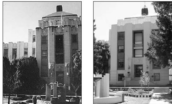
Hoover Pavilion before and after restoration. Awarded a PAST Preservation Award in 2013.