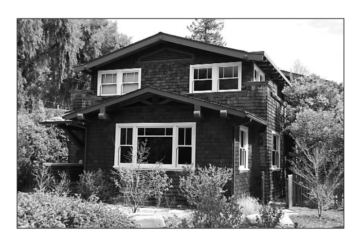
750 Palo Alto Avenue 100 years old in 2012

See more centennial houses on the web at www.pastheritage.org/plaques