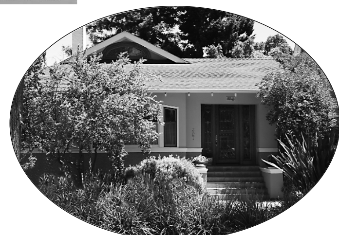
327 Waverley Street 100 years old in 2012