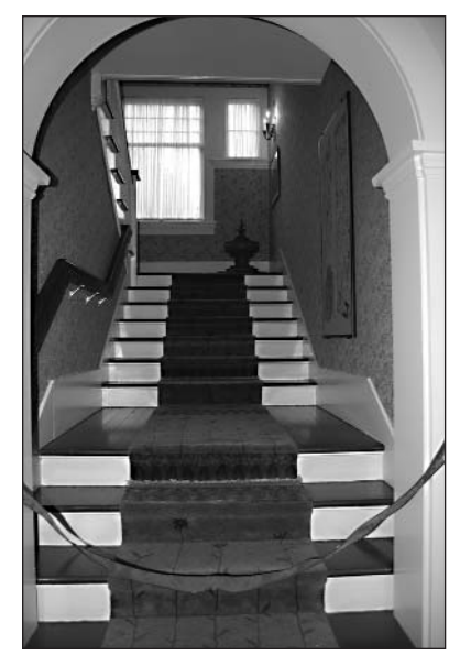
501 Kingsley Avenue

Their generosity in opening up their homes enables PAST to continue to pursue its mission of advocating for the preservation of the historic architecture, neighborhoods, and character of the greater Palo Alto-Stanford area, both in the moment and moving forward.**