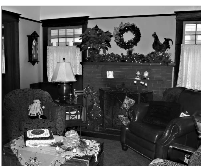
1021 Ramona Street