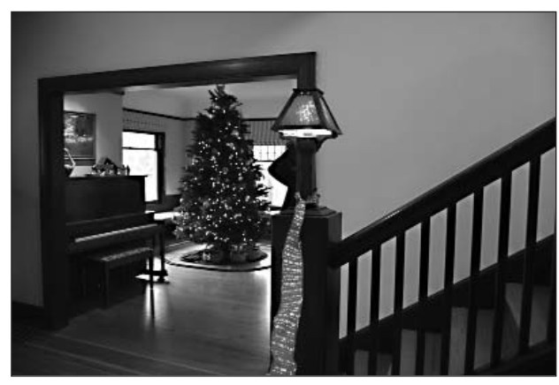
327 Addison Avenue