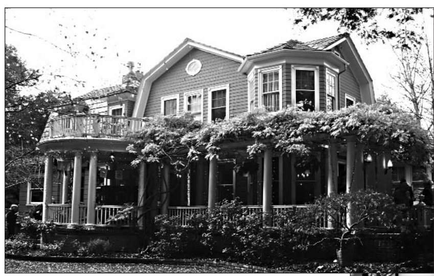
433 Kingsley Avenue