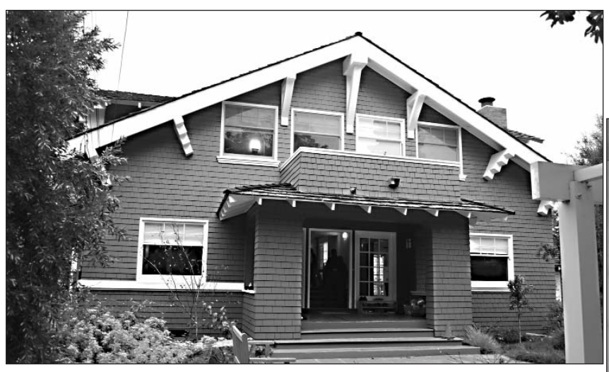
1345 Cowper Street