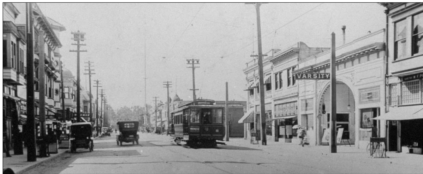
University Avenue about 1913 showing a streetcar and the original Varsity which was on the other side of the street and closer to Alma.