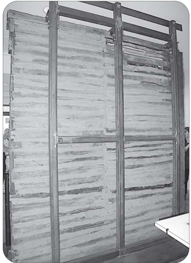
Preserved wall from the rear.