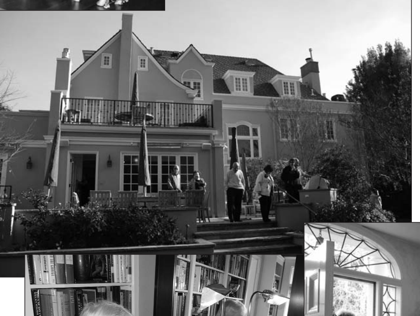
Be sure to visit the PAST website at www.pastheritage.org for more pictures and descriptions of our Holiday House Tours!