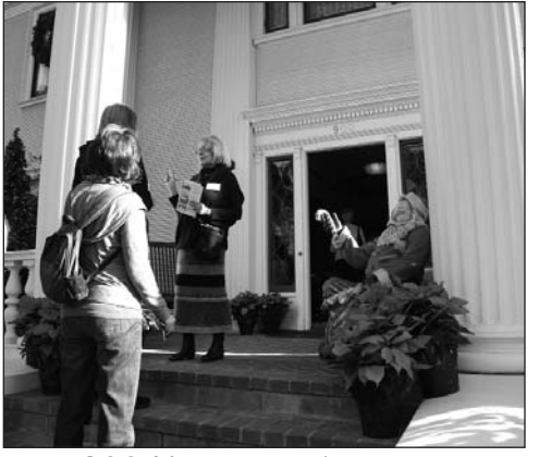
900 University Avenue