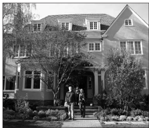
855 Hamilton Avenue

"The tour was quite a success! People had such a good time asking questions, appreciating works of art and enjoying my family's home." (Owner)