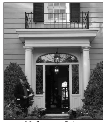
39 Crescent Drive