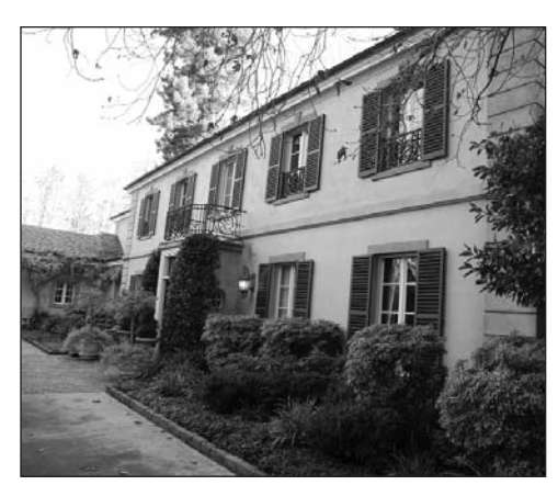
419 Maple Street