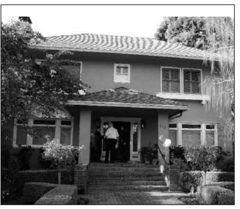
975 Hamilton Avenue