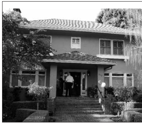
975 Hamilton Avenue