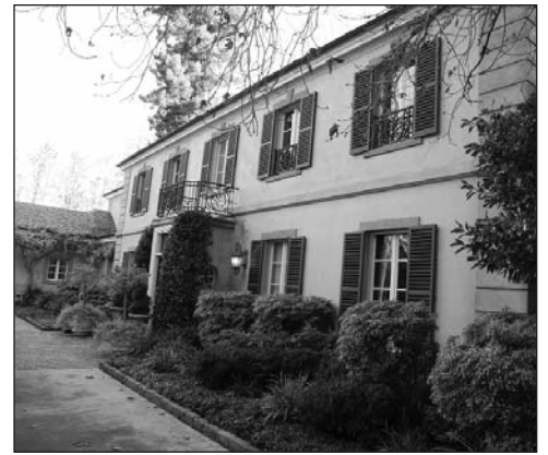
419 Maple Street

“The tour was quite a success! People had such a good time asking questions, appreciating works of art and enjoying my family’s home.” (Owner)