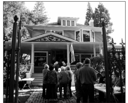
860 University Avenue