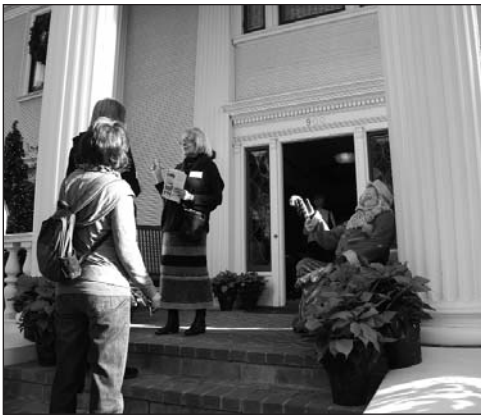
900 University Avenue