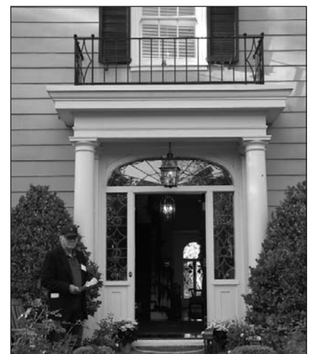
39 Crescent Drive

Be sure to visit the PAST website at www.pastheritage.org for more pictures and descriptions of our Holiday House Tours!