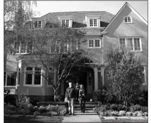
855 Hamilton Avenue

“The tour was quite a success! People had such a good time asking questions, appreciating works of art and enjoying my family’s home.” (Owner)