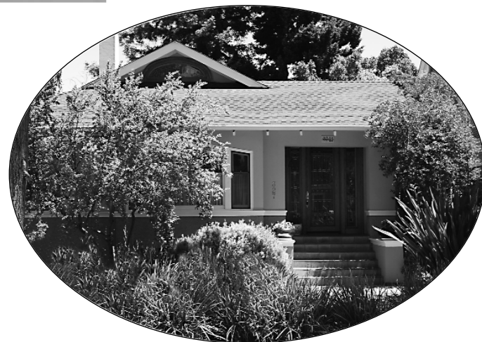
327 Waverley Street 100 years old in 2012