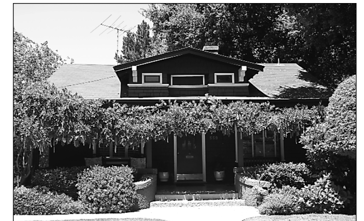
559 Kingsley Avenue 100 years old in 2012