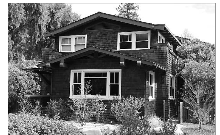
750 Palo Alto Avenue 100 years old in 2012

See more centennial houses on the web at www.pastheritage.org/plaques